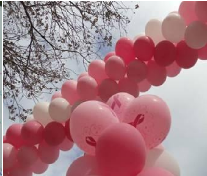
Together we make a difference!

Sincere thanks to our sponsors! We so appreciate our sponsors – they make all of this possible!